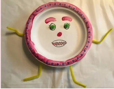
Paper Plate Monster

Column 1 Supplies: Paper plates, crayons, paintbrush, pipe cleaners, and pompoms