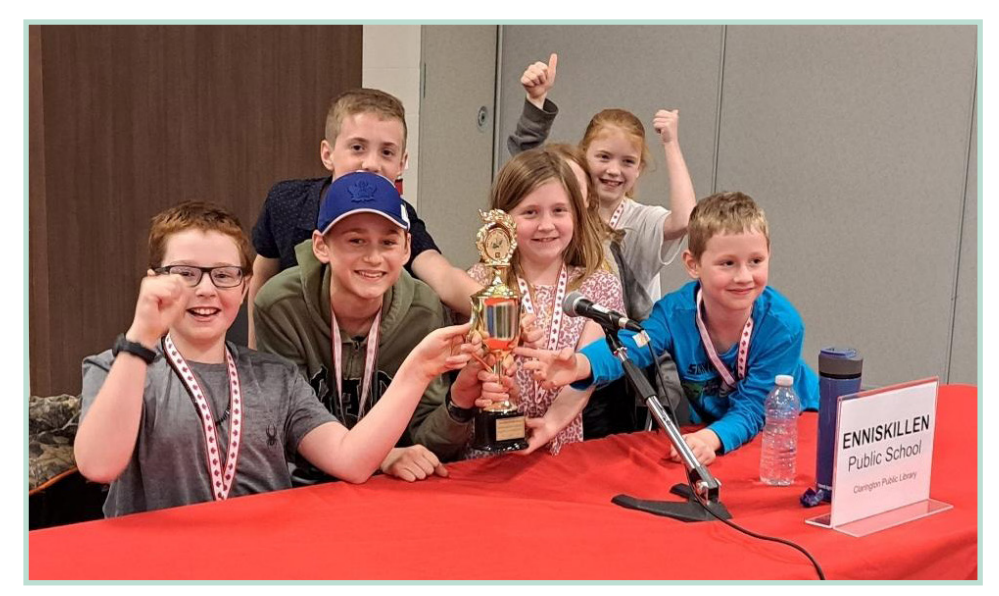
2023 Regional Junior Champions, Enniskillen Public School (Clarington)